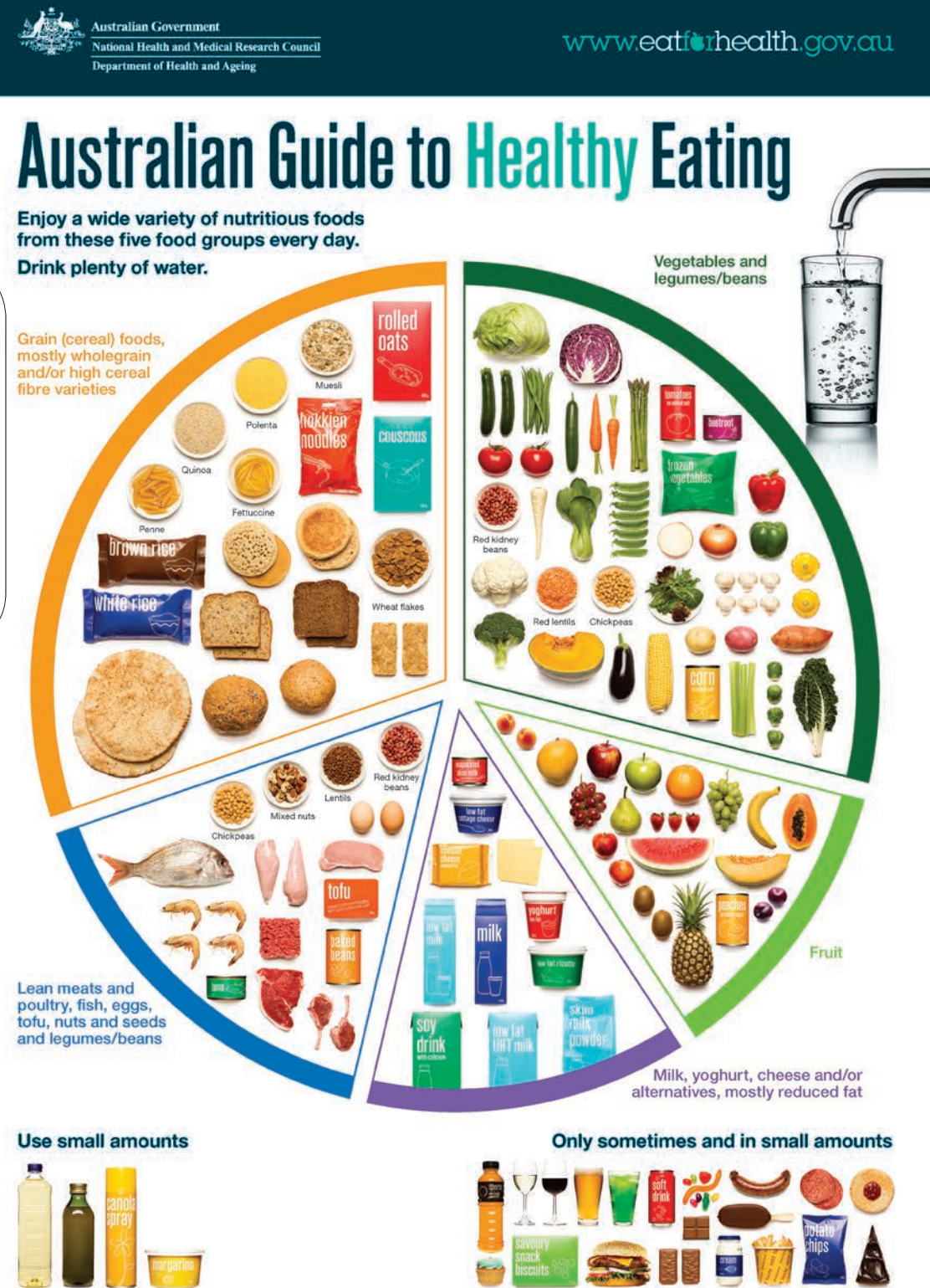
Fig 2. The Australian Guide to Healthy Eating